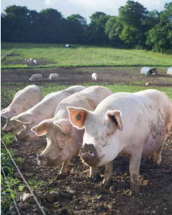
An astounding number of food companies and farmers have gone crate-free in the past couple of years, an encouraging sign that cruel gestation crates for pigs will soon be a thing of the past.

HSI AIMS TO REDUCE FARM ANIMAL SUFFERING BY WORKING TO STOP THE SPREAD OF INTENSIVE CONFINEMENT AND BY PROMOTING “GREEN” CAMPAIGNS TO REDUCE MEAT CONSUMPTION AND INCREASE SUSTAINABLE PRACTICES.