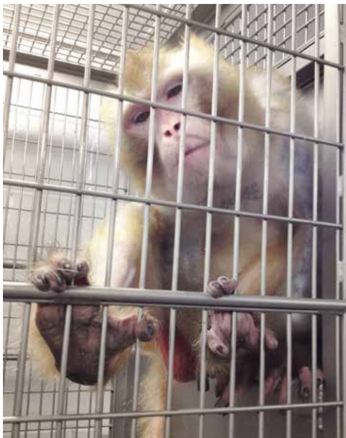
Experiments on mice, monkeys or other animals rarely mirror more than a few aspects of complex human diseases. We need better, human-relevant models to understand and cure disease biology in humans .