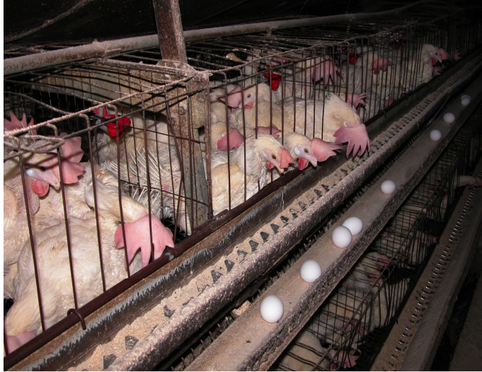
Compassion Over Killing

According to the World Health Organization, Salmonellosis is a serious problem in most countries. 30 Eggs are a leading cause of human Salmonella infection. 31,32 In 1994, a single egg-related outbreak sickened more than 200,000 Americans. 33 More typically, the U.S. Food and Drug Administration (FDA) estimates that Salmonella -tainted eggs sicken 142,000 Americans every year. 34 A 2010 multistate outbreak of Salmonella 35 led to the largest egg recall in history—more than a half billion eggs. As the FDA concluded in a 2010 press release: “Egg-associated illness caused by Salmonella is a serious public health problem.” 36