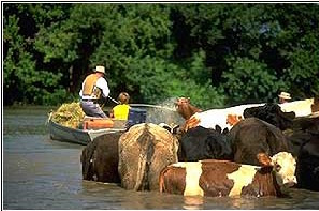
Floods in Midwest, USA