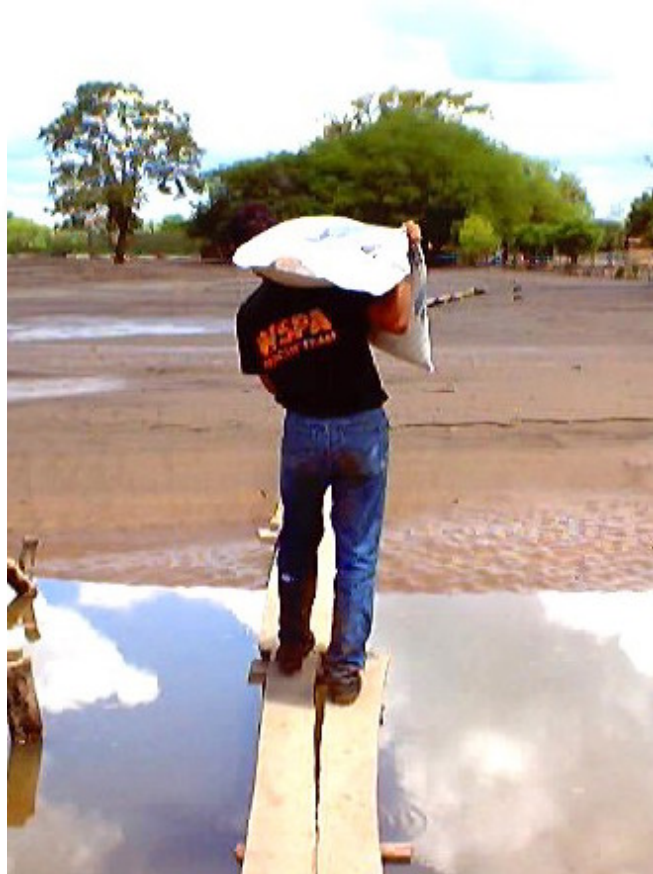
Hurricane Keith, Belize, 2000