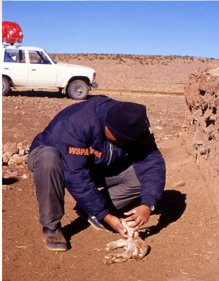
Peru blizzards, 2003