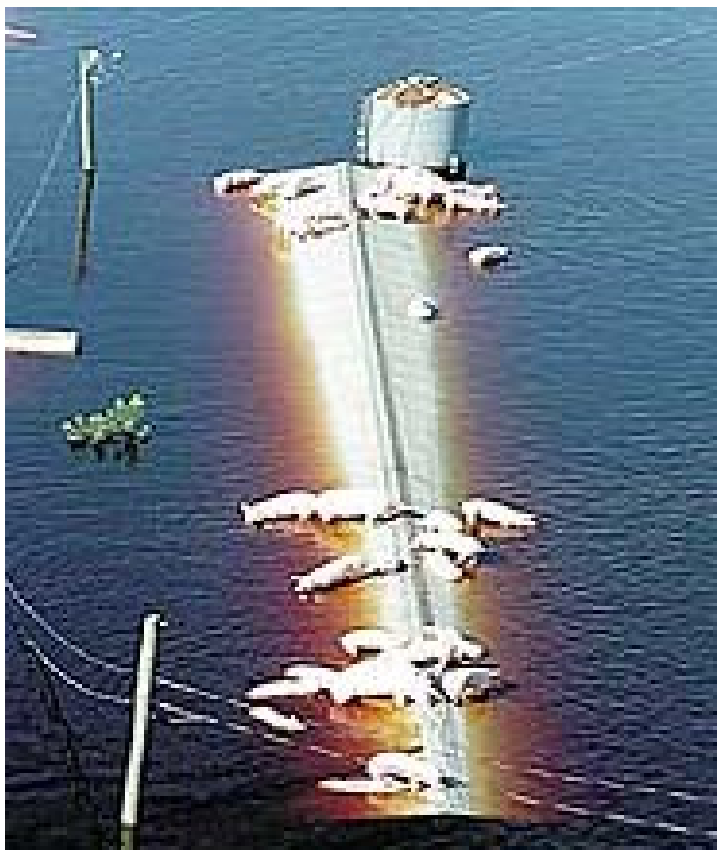
Hurricane Floyd, USA